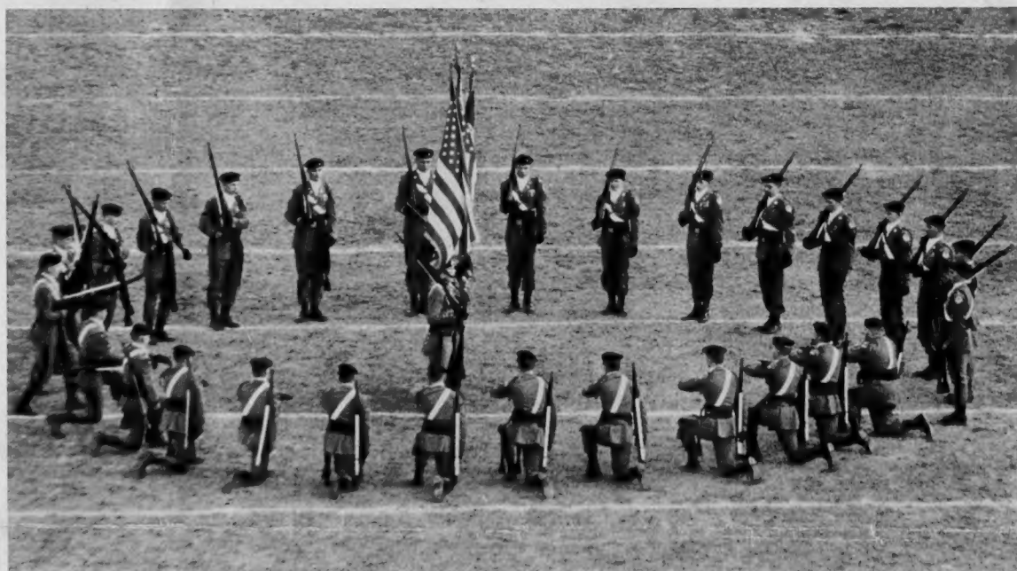
AMA's Roller Rifles, a crack drill team, perform a Queen Anne salute during the half-time show of the Turkey Day Game.